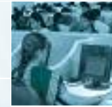
ARTS & SCIENCE COLLEGE