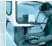
POLYTECHNIC & ITI