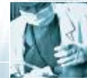
DENTAL CARE & HOSPITAL